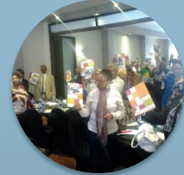
Networks & Partnerships